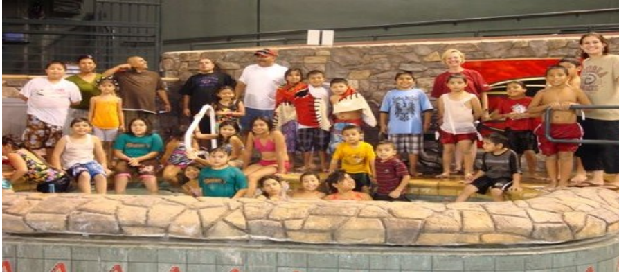
Take me out to the ballgame AND the swimming pool! Thanks to our friends at Statera, the DUCK kids spent an evening swimming and watching the game. Hot dogs, fireworks, batting practice, and SWIMMING! Thanks for a great evening Statera!